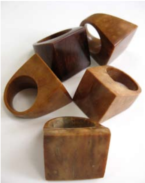
LU001 Piassava Ring Square