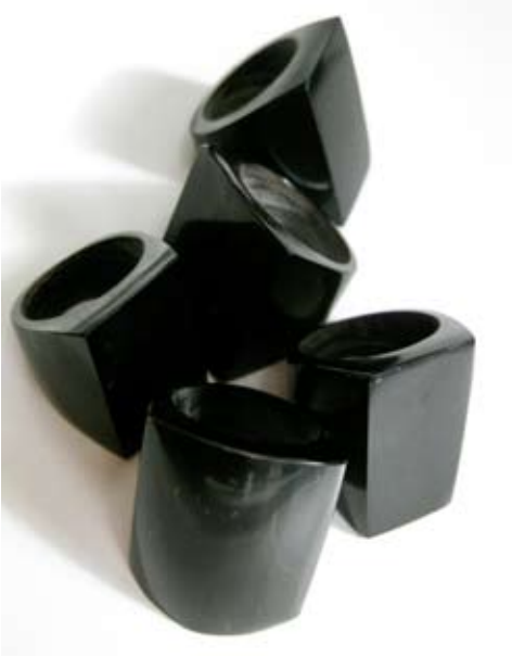
LU010 Horn Ring