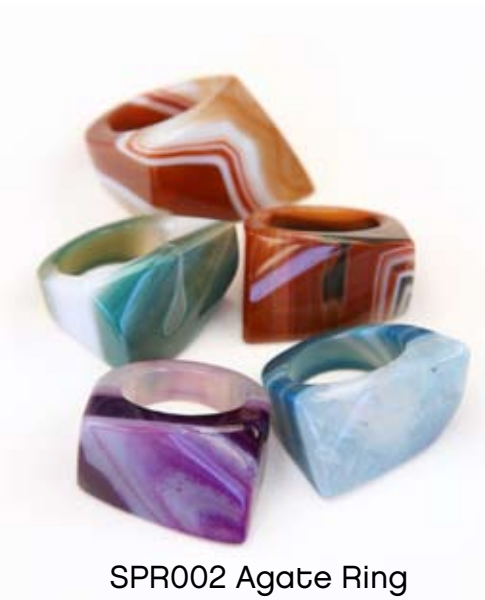
SPR002 Agate Ring