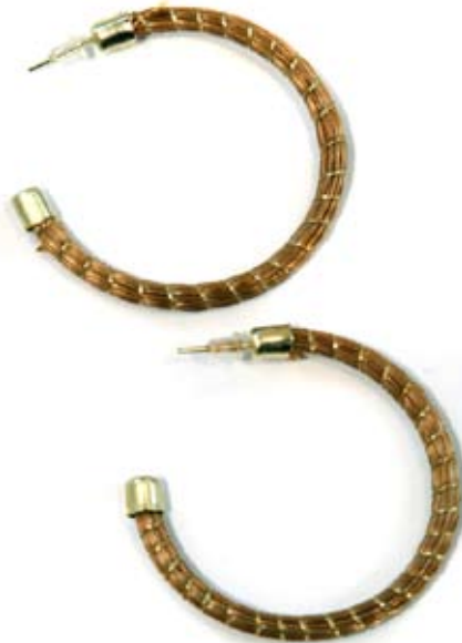
CD006 Capim Dourado Hoop Earring