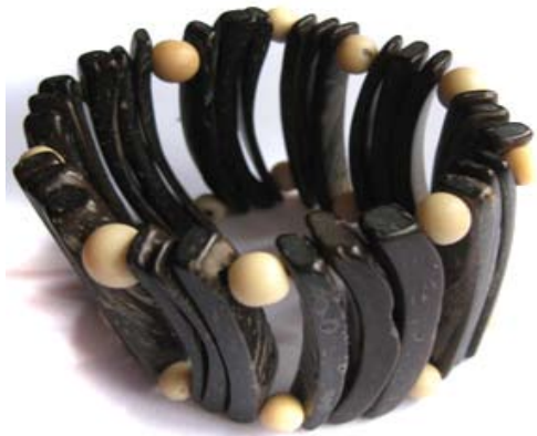
NT004 Açaí Coco Bracelet