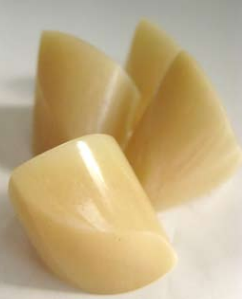
LU021 Bone Ring