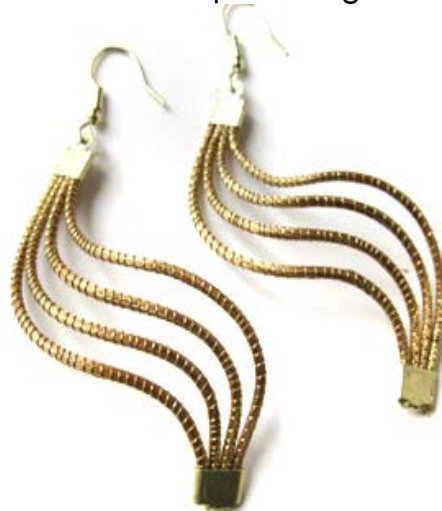
CD012 Capim Dourado Wave Earring