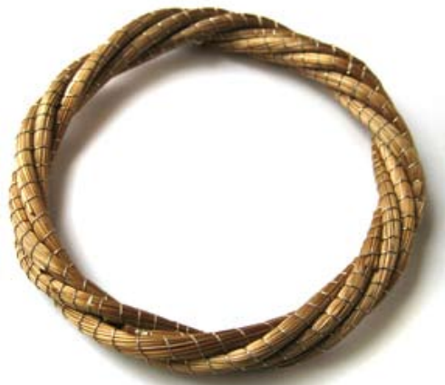
CD015 Capim Dourado Twist Bangle