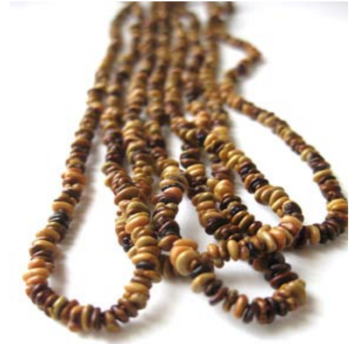
NT003 Tiririca Necklace