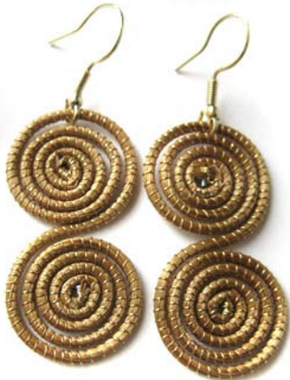
CD011 Capim Dourado Spiral Earring