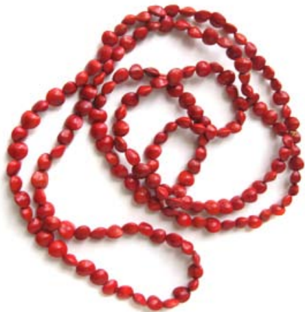
NT001 Tento Vermelho Necklace