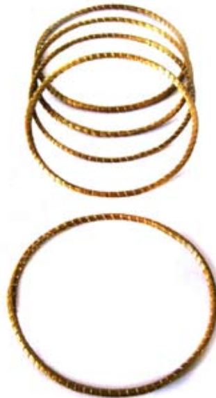
CD002 Capim Dourado Thin Bangle