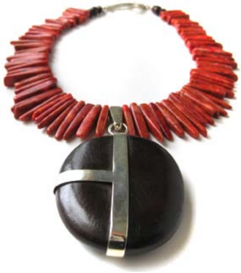
PR 206 Coral, Alibe Seed and Sterling Silver necklace