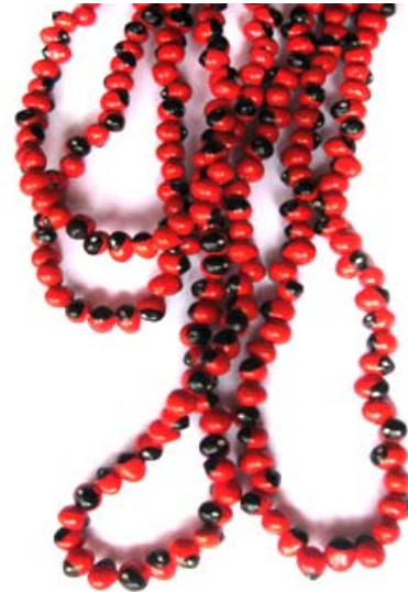
NT002 Olho de Pombo Necklace