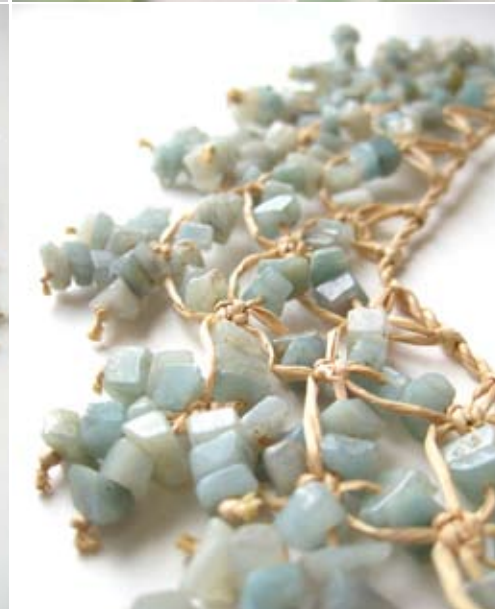
SPP001 Amazonite and Raffia Macrame Necklace