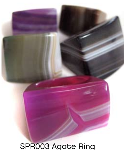
SPR003 Agate Ring