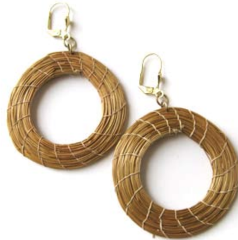
CD010 Capim Dourado Circle Earring