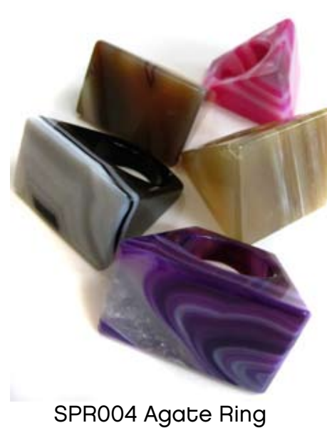
SPR004 Agate Ring