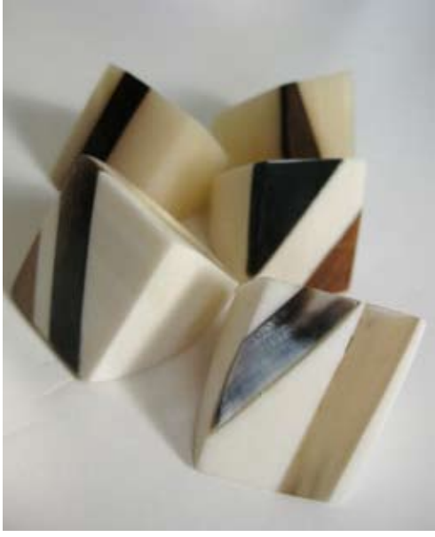
LU020 Bone Ring with Insert