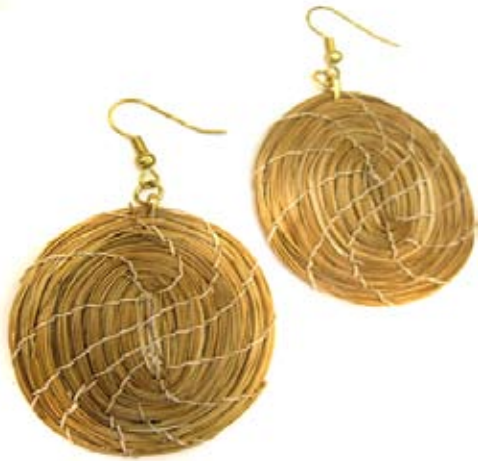
CD003 Capim Dourado Disk Earring