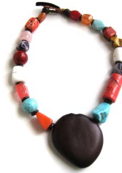
SP036 Mixed stones, Alibe Seed and Wood Necklace