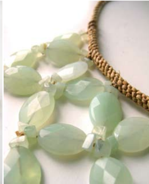
SPP001 Adventurine and Raffia Macrame Necklace