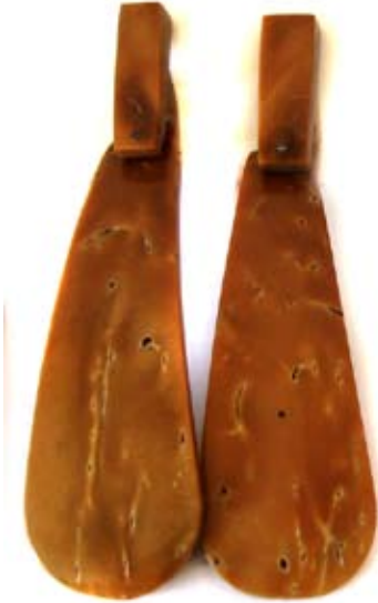
LU0G5P Piassava Earring