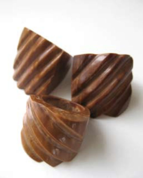
LU031 Piassava Ring Grooves