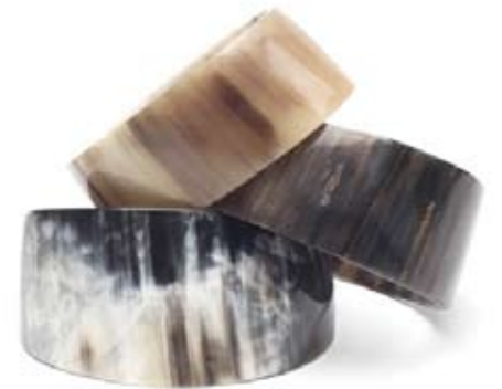
LU033 Horn Bangle