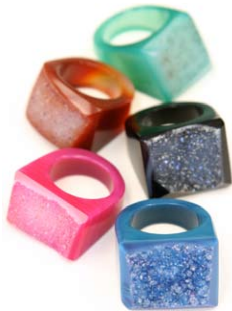
SPR001 Agate Geode Ring