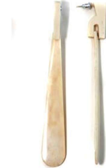
LUG8B Bone Earring