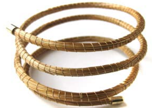
CD014 Capim Dourado Spring Bracelet