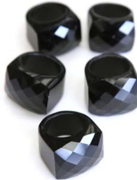
SPR006 Faceted Onyx Ring