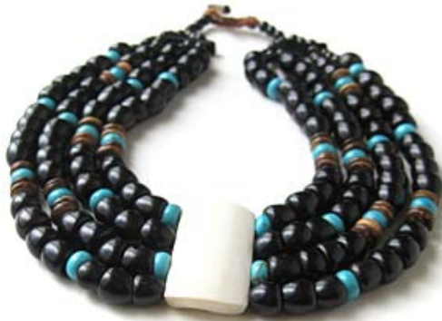
SP167 Coconut, Turquoise, and Bone necklace