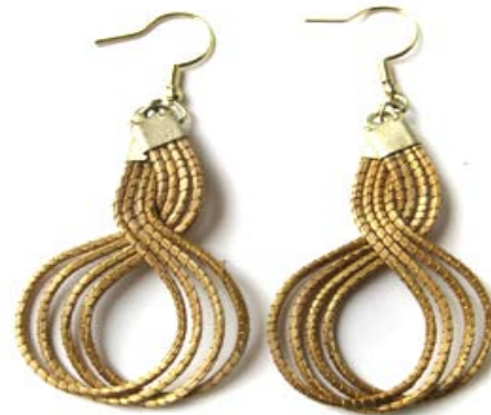
CD013 Capim Dourado Eight Earring