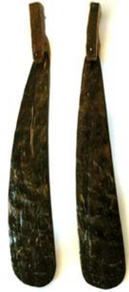
LUG8C Coconut Earring