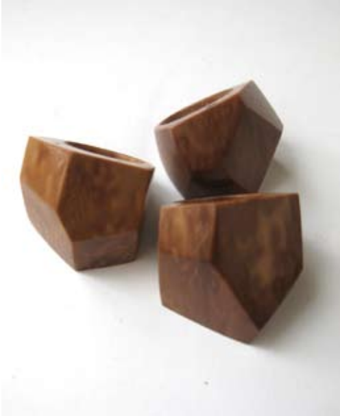
LU030 Piassava Ring Facets