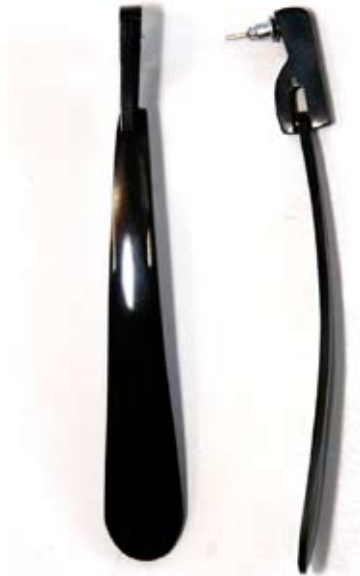
LUG8H Horn Earring