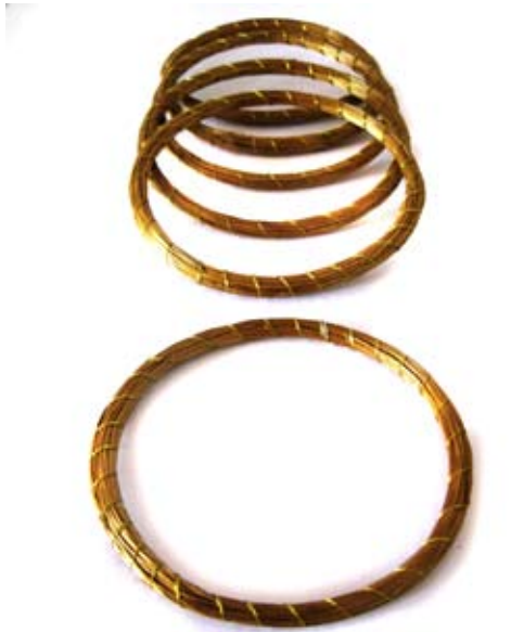
CD001 Capim Dourado Bangle