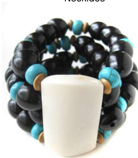
PUL167 Coconut, Turquoise, and Bone bracelet