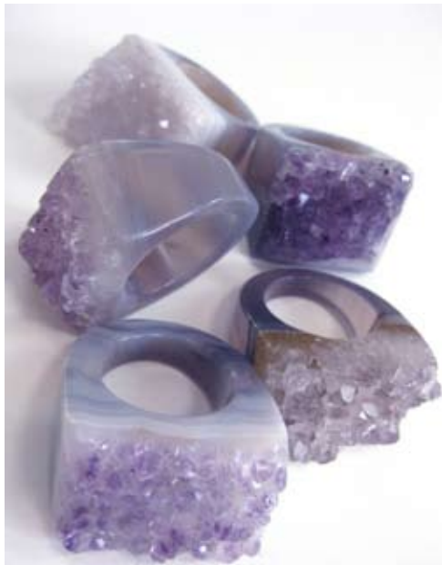
SPR001A Amethyst Geode Ring